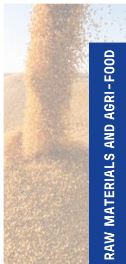
RAW MATERIALS AND AGRI-FOOD