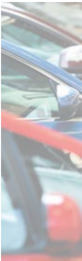
AUTOMOTIVE AND TRANSPORTATION