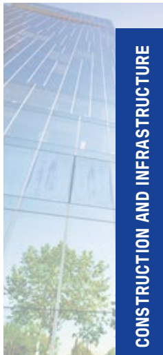
CONSTRUCTION AND INFRASTRUCTURE