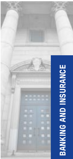
BANKING AND INSURANCE