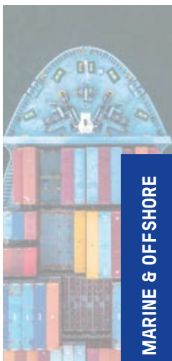
MARINE & OFFSHORE